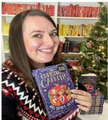
The Christmas Carrolls is a Top 20 Bestseller!