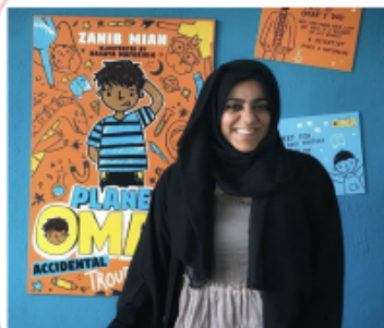
Little Rebels Children's Book Award 2018 for 'The Muslims'.