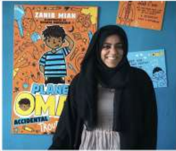
Little Rebels Children's Book Award 2018 for 'The Muslims'.